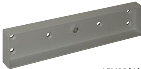
AEMBR019 Flush/Mortice Armature Housing