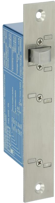
ASA66 Single Action

The motor driven Electronic Side Load Lock is available for single or double acting doors in both commercial and residential areas of a building.