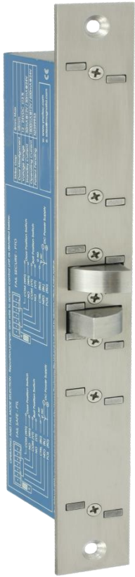
ADA66 Double Action