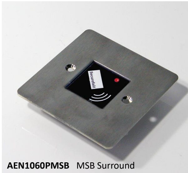
AEN1060PM Panel Mount Reader

Many card types and output formats are available - details are available on request from our sales office. Outputs are diode protected.