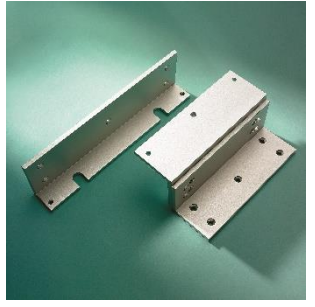
AEMBR026 Z&L Bracket to suit Inward Opening Doors