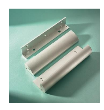
AMH595/ZA Architectural Z&L Bracket to suit Inward Opening Doors